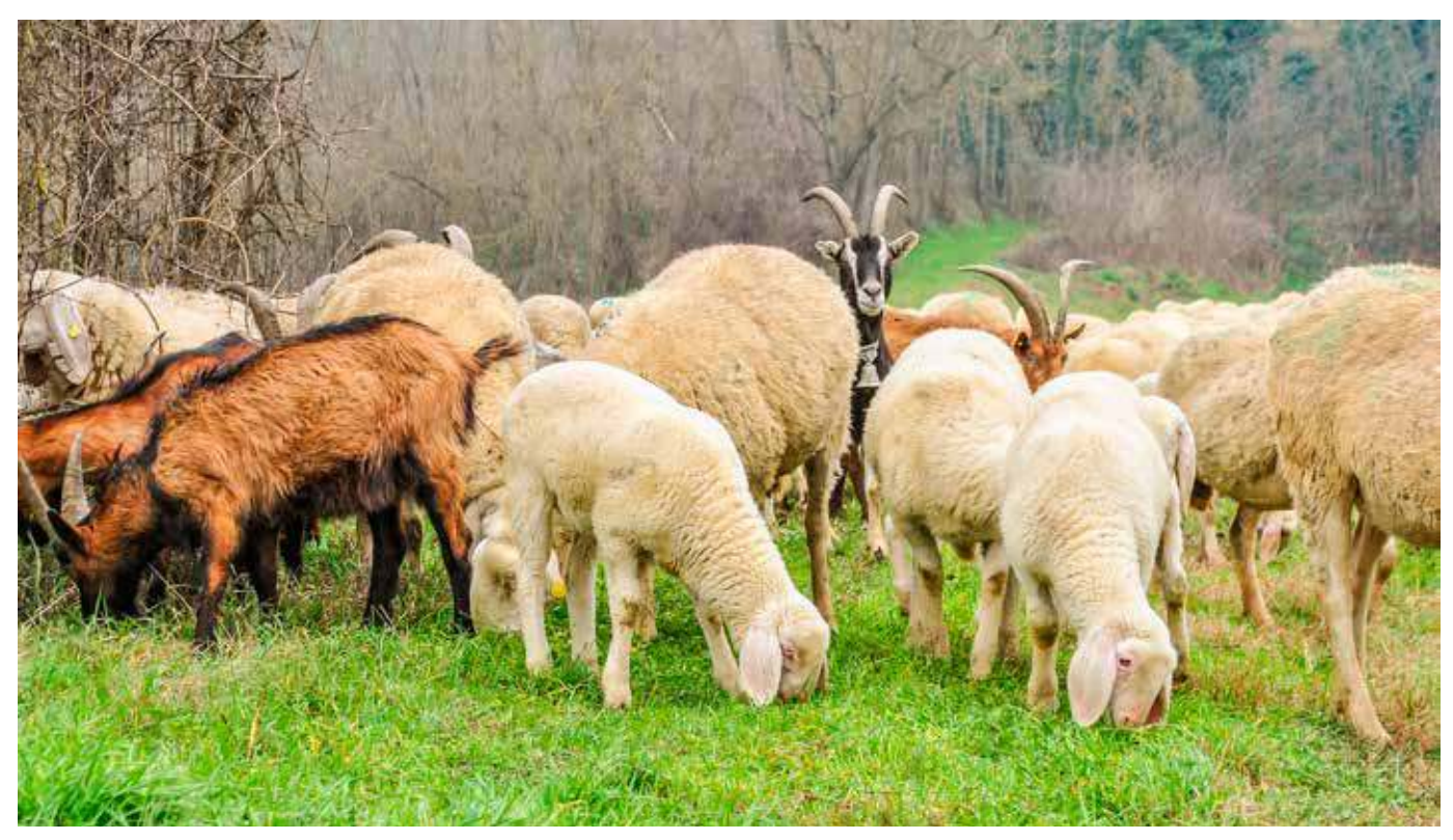
Figure 1. Sheep and goats