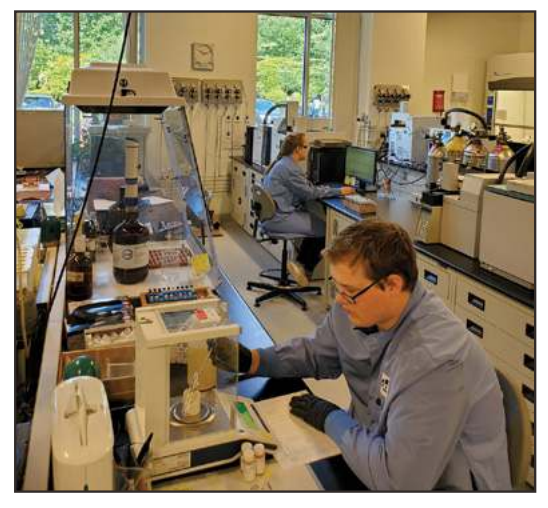
Doble Materials Laboratories, established in 1933, can perform over 200 laboratory tests on both solid and liquid insulation